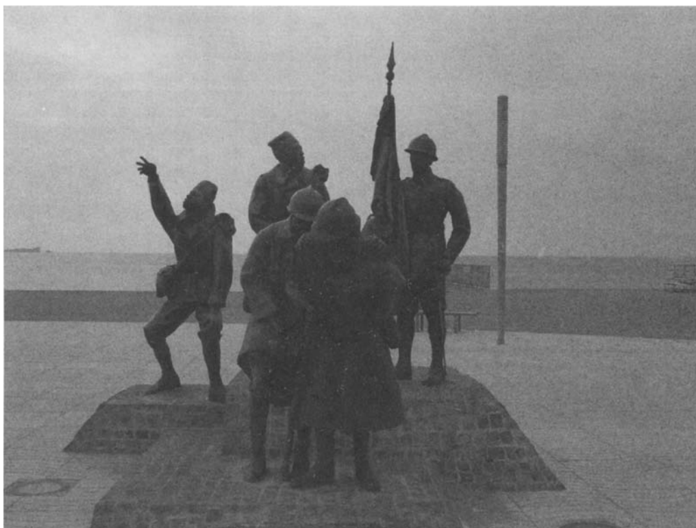
FIGURE 3: À l'Armée Noire , Fréjus. Dedicated September 1, 1994.

THE NEW STATUE STANDS ON THE PROMENADE, its back to the sea. Erected by an association of former military officers, aided by the national and municipal governments, the monument plays on the statue in Bamako. In this new sculpture, the heroic pose of the 1920s has given way to a loose cluster of individual figures whose faces express confusion, pain, suffering, and camaraderie. (See Figure 3.) The sole European depicted, the central figure in the 1920s version, now stands isolated, and his support of the flag is only one among many narrative elements. One tirailleur walks upright, looking at the flag with an open, perhaps querying expression; another, his knees bent, gestures away from it into the open air. In the foreground, two companions stagger or huddle, and one leans on his rifle for support while his comrade seems to encourage him. 65