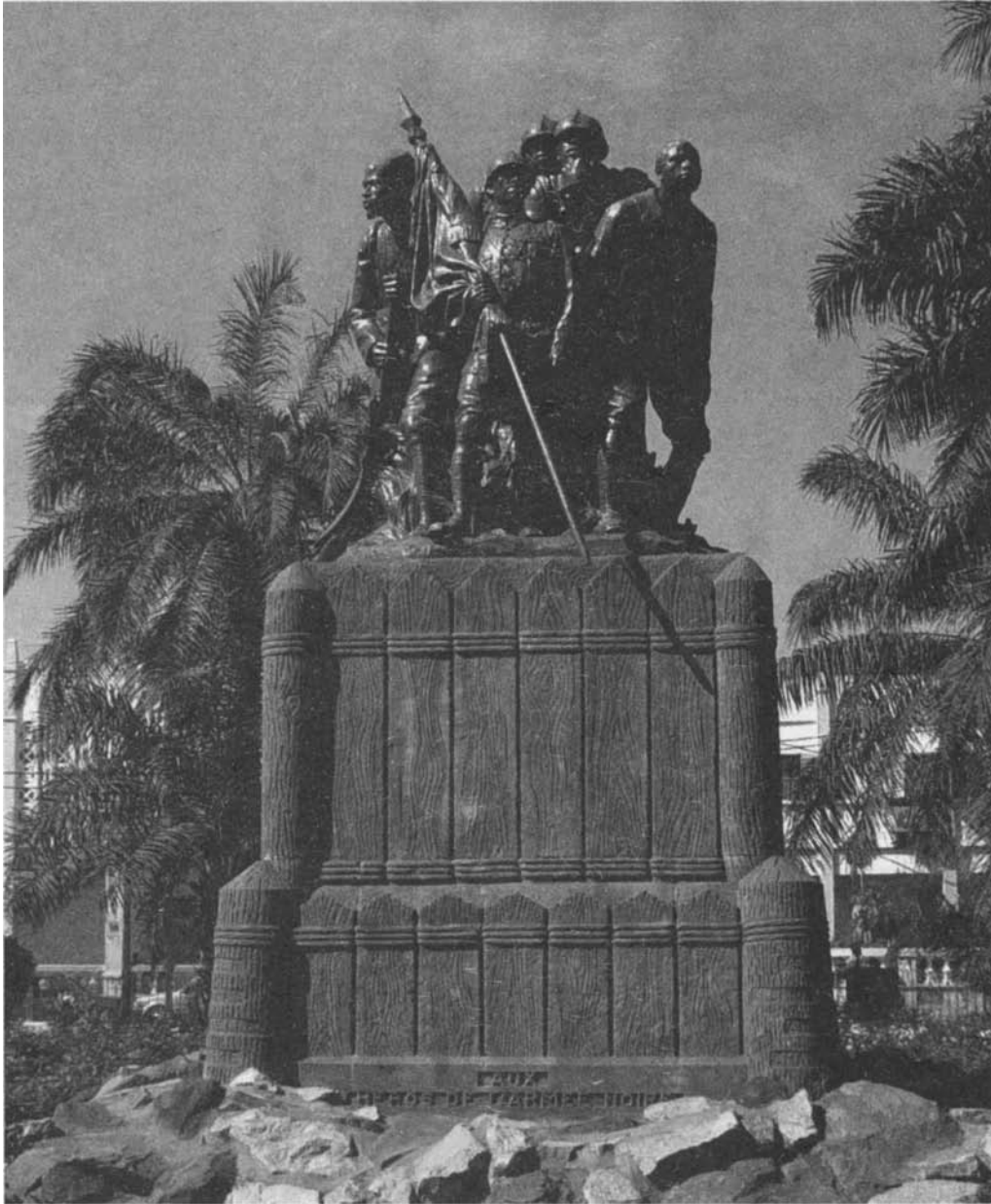
FIGURE 1: Aux Héros de l'Armée Noire , Bamako. 2002.

African and other non-European troops in the occupation of the Rhineland. In his speech inaugurating the monument, General Louis Archinard, one of the primary architects of the conquest of the Western Sudan, underscored this point when he proclaimed the tirailleurs to be “ des Français noirs .” The depth of the relationship was then highlighted by a spectacular “historical parade [representing] all the Native troops” from the time of the Bourbon Restoration to the tirailleurs