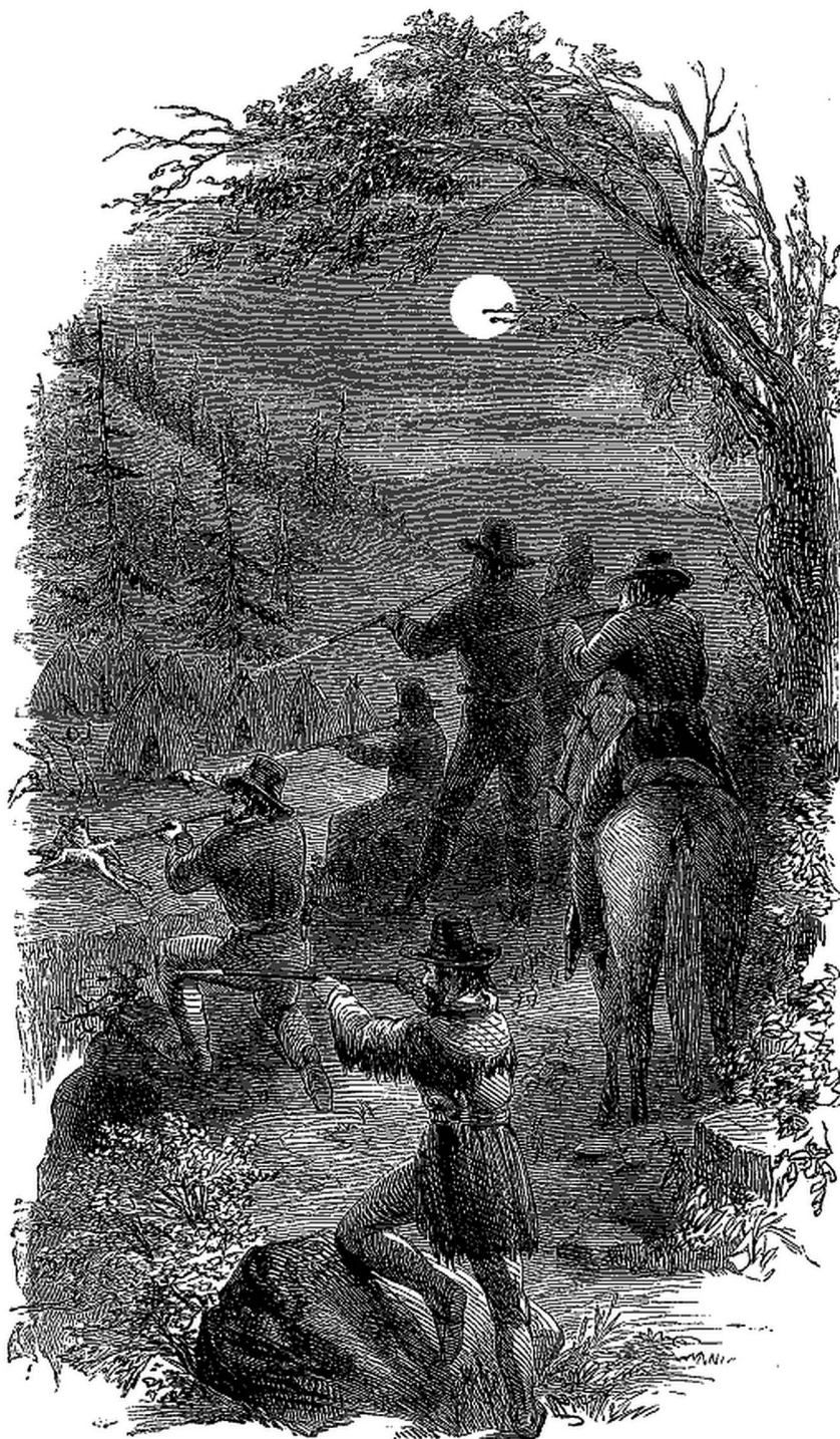
PROTECTING THE SETTLERS.

FIGURE 4: J. Ross Browne, "Protecting the Settlers." From Browne, "The Coast Rangers: A Chronicle of Events in California," part II: "The Indian Reservation," Harper's New Monthly Magazine 23, no. 135 (August 1861): 313. Courtesy of the Beinecke Library, Yale University, New Haven, Connecticut. This image accompanied an article by Browne in which he described the killing of Yuki people at Round Valley, California.